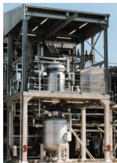
Catalyst recovery system