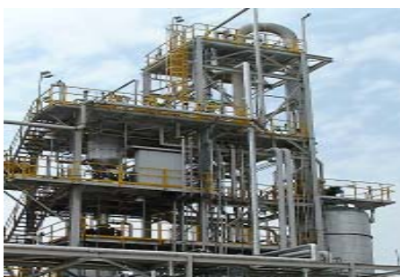
FUNDABAC® filter system installed in a Far-Eastern petrochemical complex